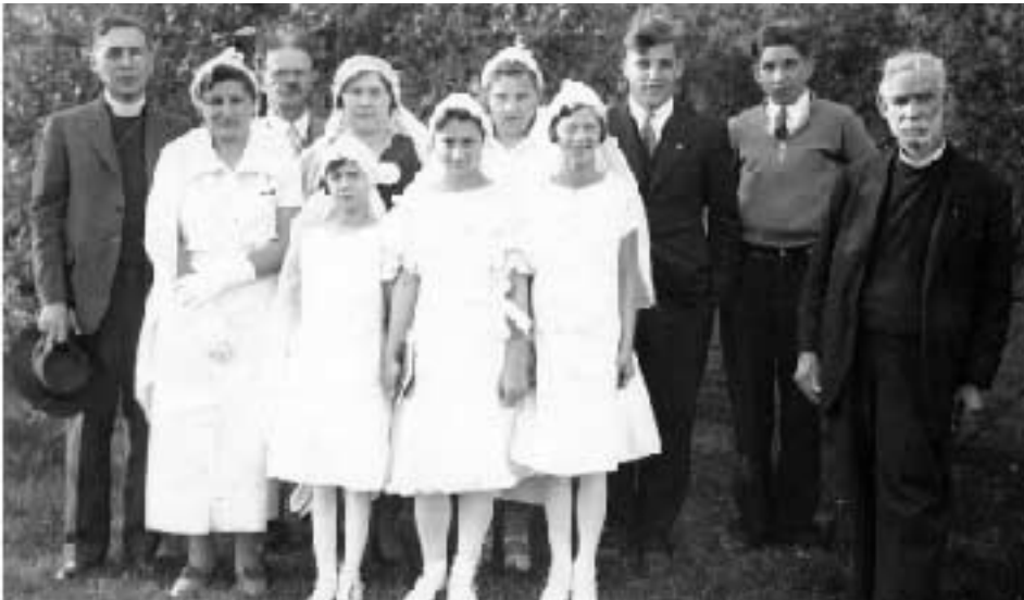
Mystery Photo: Can you identify any of these Jacksonport people?

This 11th annual Cherry Fest is sponsored by the Jacksonport Historical Society and there is no admission fee to the public. All proceeds will benefit the society, a local non-profit organization. We thank you for your support. For more information call 920-823-2288 or email jarosh@dcwis.com