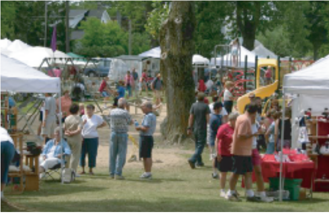
The Arts & Crafts Fair at Cherry Fest boasts over 115 juried booths at beautiful Lakeside Park in Jacksonport with something to please everyone.

The picturesque village of Jacksonport, Highway 57, Door County, will be the scene of the 11th annual Cherry Fest on Saturday, August 6, 2005. Beautiful Lakeside Park, on the shore of Lake Michigan, is the setting for the annual event which is sponsored by the Jacksonport Historical Society, a local, non-profit organization.