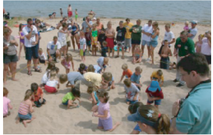
The Penny Hunt on the beach at Lakeside Park during Cherry Fest is a real crowd pleaser and fun for the little ones.

The Erskine Root Cellar, located in the Erskine Rest Area has been completely restored and will be open to the public for viewing during Cherry